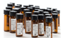
Lab Sample Tracking